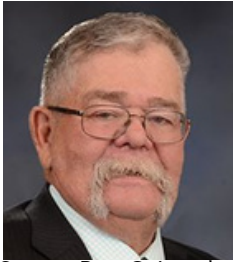
Senator Pete Goicoechea Eureka, NV