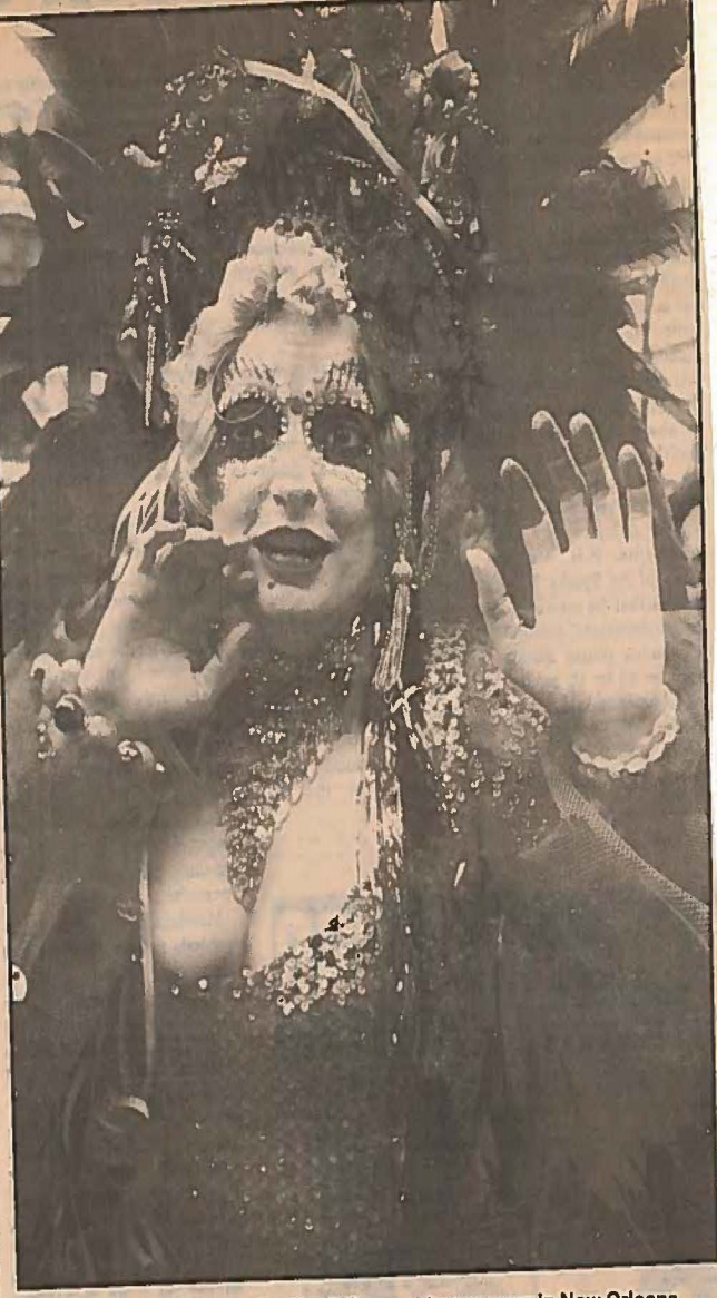
One of the very decorative Mardi Gras costumes seen in New Orleans.

Masks for both men and women can be custom ordered any planned outfit or costume. enjoy the Ball. in keeping with The Ball will begin with the County Scholarship Fund.